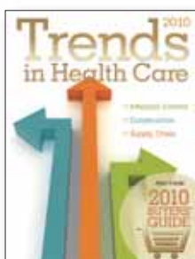
Trends in Health Care