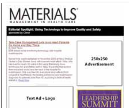
Custom Direct E-newsletter