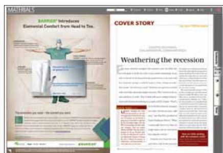
Digital Edition with Video Overlay

The Digital Edition offers a limited number of sponsors the possibility to strengthen their visibility in a monthly issue. There are exclusive Digital-Edition-only options that can enhance visibility among readers. For additional information, see the Health Forum Electronic Media brochure or contact your Account Manager .