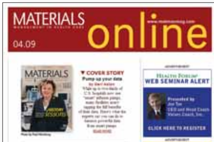
MMHC Online E-newsletter

MMHC editors and content experts work with advertisers and corporate underwriters to prepare content and ensure it is delivered to targeted audiences within deadline parameters. We report on audience delivery and messaging performance and measure the impact your message has among target groups. Aside from getting “pushed” out to readers, “push” media content like podcasts and blogs are placed on the MMHC Web site and on the Health Forum Leadership Center site where it is promoted and archived for broad audience distribution. For additional information, see the Health Forum Electronic Media brochure or contact your Account Manager .